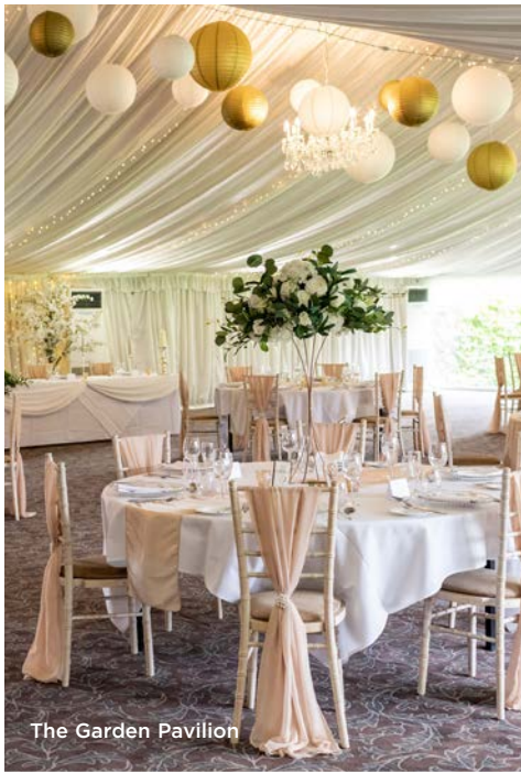
The Garden Pavilion