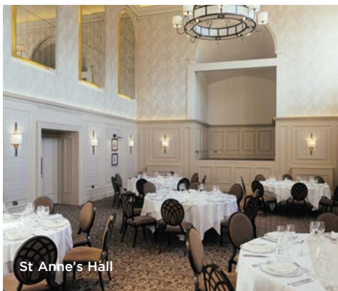
St Anne's Hall